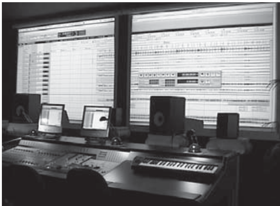
Box Hill Institute ProTools training studio

Given this investment, it is surprising that few institutions have exploited it further. The expansion of web-based access over multiple locations remains the exception rather than the norm. One